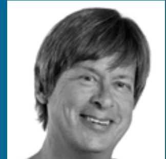
Dave Barry Pulitzer Prize winning Author